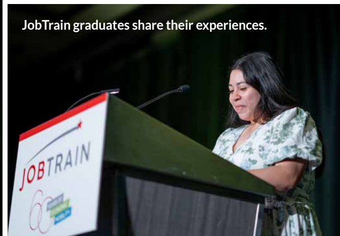
JobTrain graduates share their experiences.