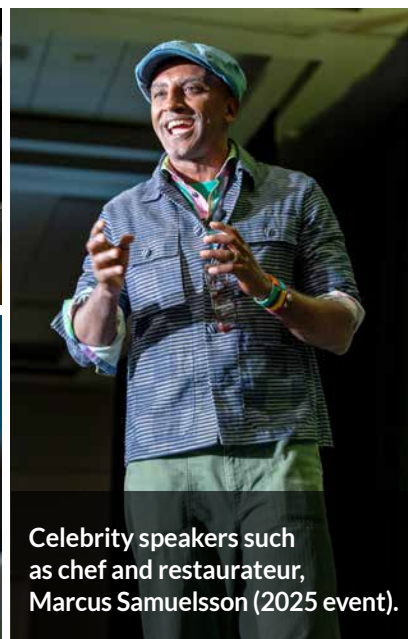
Celebrity speakers such as chef and restaurateur, Marcus Samuelsson (2025 event).