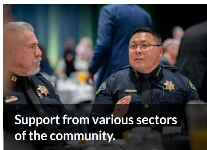
Support from various sectors of the community.