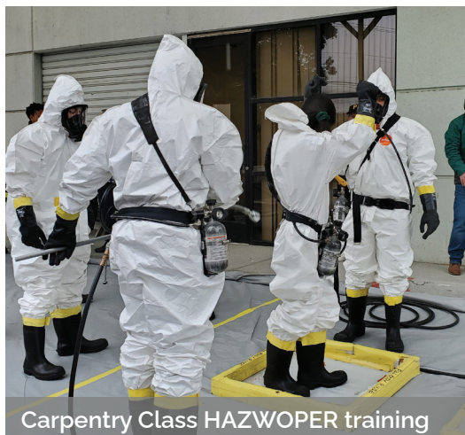
Carpentry Class HAZWOPER training