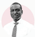
Guest Speaker Dr. Yusef Salaam of The Exonerated Five