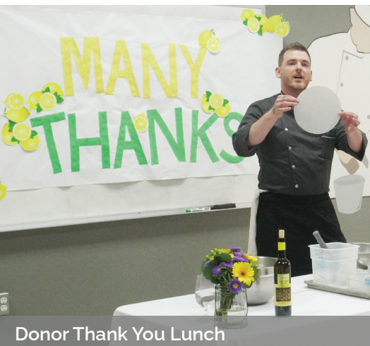
Donor Thank You Lunch