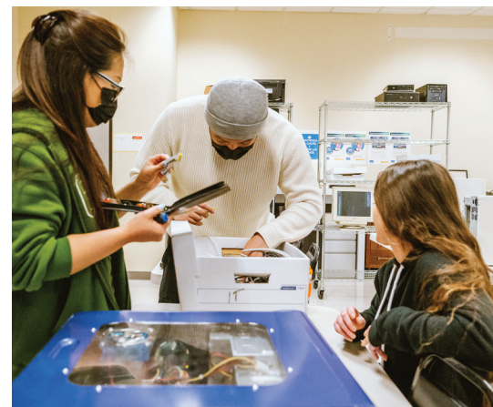
IT Class hands on