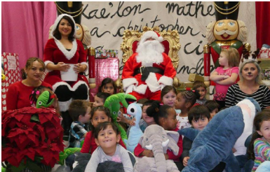
TE Connectivity sponsors children's Gift Wishes at JobTrain's annual Winter Wonderland!

TE Connectivity has been a JobTrain supporter for over two decades! Their commitment to JobTrain includes grants for programs, scholarships for students and event sponsorships. In addition to providing financial support, TE employees have served on JobTrain's Technical Advisory Committee (TAC), provided Life Skills classes for students, and hired JobTrain graduates, which has led to high quality careers for our graduates. TE employees' giving spirit is in full-swing every holiday season. TE volunteers and members of WIN (Women in Networking) at TE roll up their sleeves collecting clothes for JobTrain's Clothes Closet, and they provide support for JobTrain's Winter Wonderland. Employees held a month-long clothing drive collecting hundreds of professional outfits to help our graduates look sharp for job interviews. To make sure JobTrain's Winter Wonderland is a special celebration for children of students in JobTrain programs, TE employees donate toys for Winter Wonderland, ensuring every child received personalized gifts.