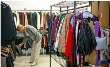
JobTrain's Clothes Closet: provides business attire to students.