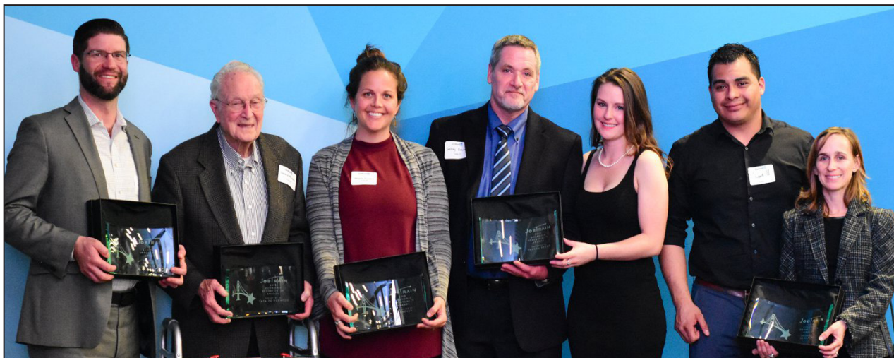
Representatives from this year's winning companies receiving their awards at the 2nd Annual Economic Opportunity Awards Ceremony.

Whether or not you were able to join us this year, we hope to see you at the 3rd Annual Economic Opportunity Awards ceremony next year!